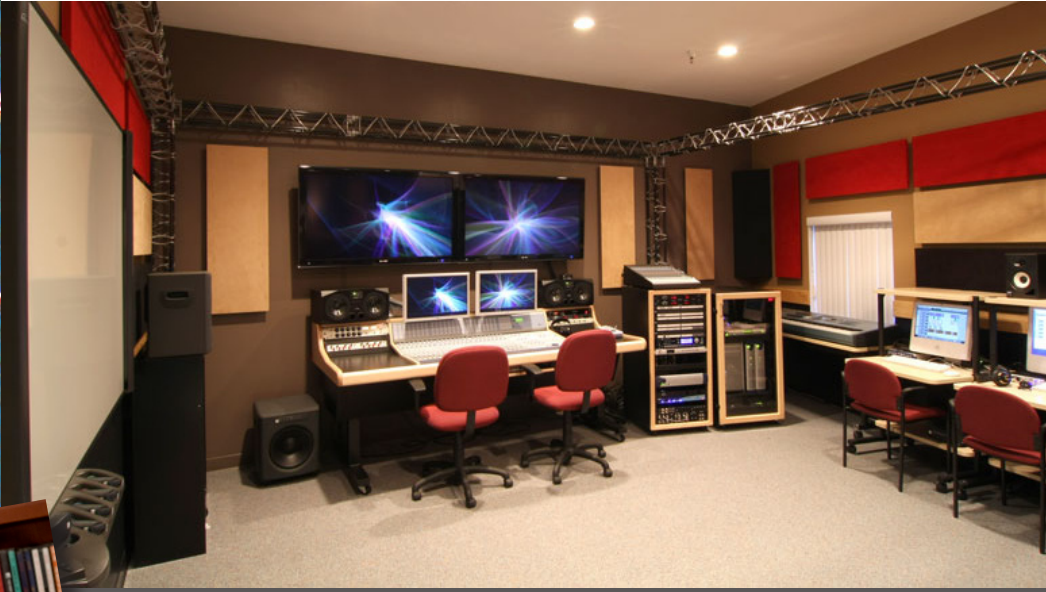
UCI Arts' sound studio will benefit from a gift from Meyer Sound Laboratories.

I am pleased to report that our sound design program has received a generous $300,000 gift from Meyer Sound Laboratories, a premier audio company with customers and offices worldwide.