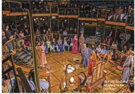
Directed at UCI, the model after the Row (Down Elizabeth's Row at Chamberlain's (Finnish Seating). The Groundlings and more info: shakespeare.com .

drawings and paintings made of wood, a paper used for origami. Free. Alachua Cultural Center, 1201 W. Malvern Ave., Fullerton, 714.738.6195. thecook.org