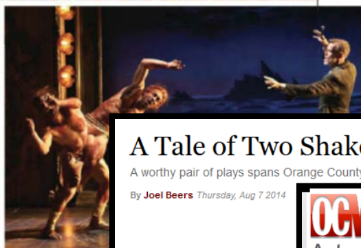
Shakespeare by the Sea's production of Hamlet and A Midsummer Night's Dream were a hit in Newport's Bonita Cal Sports Park in July and the same at Irvine Valley College August 1-3 in Seal Beach August 3. If you miss you can see Dana Point Theater Co's free show of Shakespearean scenes Larston Bay Park August 21 and the most anticipated and ambitious production is South Coast Repertory's production of Hamlet at the Segerstrom Center for the Arts in Long Beach August 21-23.

SoCal's summer of Shakespeare is well under way, and isn't it wonderful? The idea that we can see masterpieces from the canon of world culture performed in parks, playhouses and under the stars every year is sort of amazing. UC Irvine's New Swan Shakespeare Festival is ongoing through August 30, with productions of Twelfth Night and Romeo and Juliet performed outdoors and in the round at the cool New Swan Theater on campus. August 1 is the final show of Shakespeare OC's innovative production of A Midsummer Night's Dream that's set in Polynesia during the 1700s and was co-produced by and features dancers and musicians from Garden Grove's Polynesian dance group, Hula O'le Ila. Shakespeare OC's production of Romeo and Juliet, scheduled for September, has been pushed back to 2015 because of the popularity of the group's non-Shakespeare productions in The Garden Grove Amphitheater.